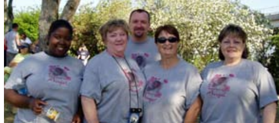
Council staff gather prior to participation in the March of Dimes March for Babies.