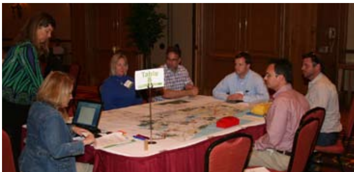
Reality Check First Coast participants and volunteers go through a simulation of "Game Day" at the recent dress rehearsal.

On Friday, April 17, 2009 Regional Council staff gathered along with numerous other volunteers and our partners from the North Florida District of the Urban Land Institute at the St. Johns County Convention Center at the World Golf Village in St. Augustine, to hold a Dress Rehearsal for the upcoming Regional visioning exercise Reality Check First Coast.