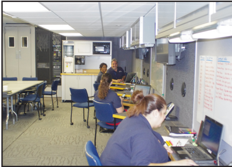
Photos Above and Below: Emergency responders are tested by "Hurricane Griffin" at the State Hurricane Exercise