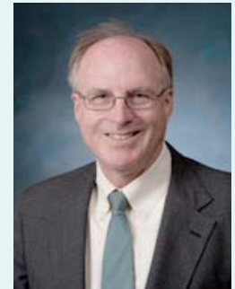
The Honorable Matt Schellenberg, City of Jacksonville Councilman