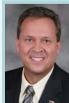
The Honorable Harold Rutledge