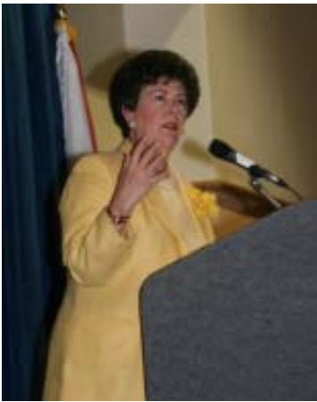
Florida's Lieutenant Governor, The Honorable Toni Jennings, was Keynote Speaker during the lunch portion of the State Summit.