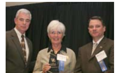
Regional Quality of Life Award