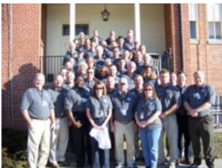
Left: Members of the Putnam County EOC team and NEFRC staff at the Emergency Management Institute in Emmitsburg, Maryland.