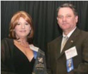
Regional Award for Excellence in Affordable Housing