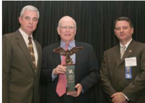
Harry Waldron Award