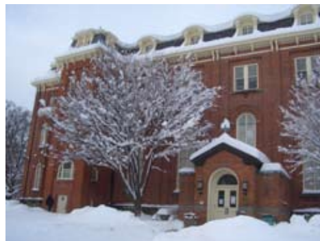
Record snowfall in the mid-Atlantic region postponed the group's return to Northeast Florida.