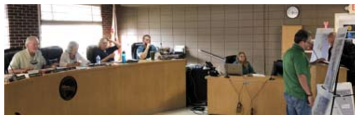
The 2035 Comprehensive Plan is presented to the public and members of the Planning & Architectural Review Board.