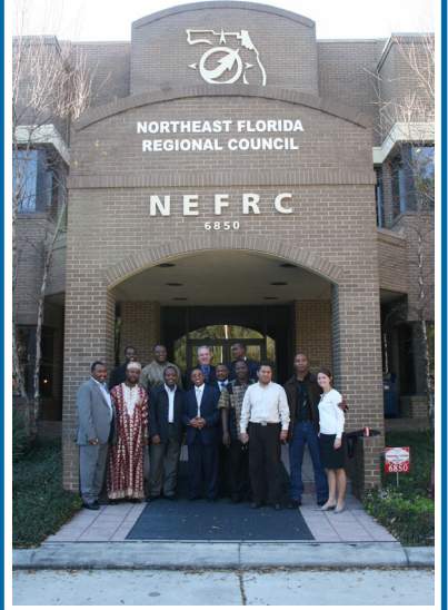
Members of the African Delegation pose with Council staff during their recent visit to Northeast Florida.